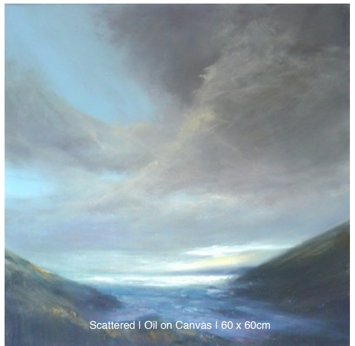
Scattered | Oil on Canvas | 60 x 60cm