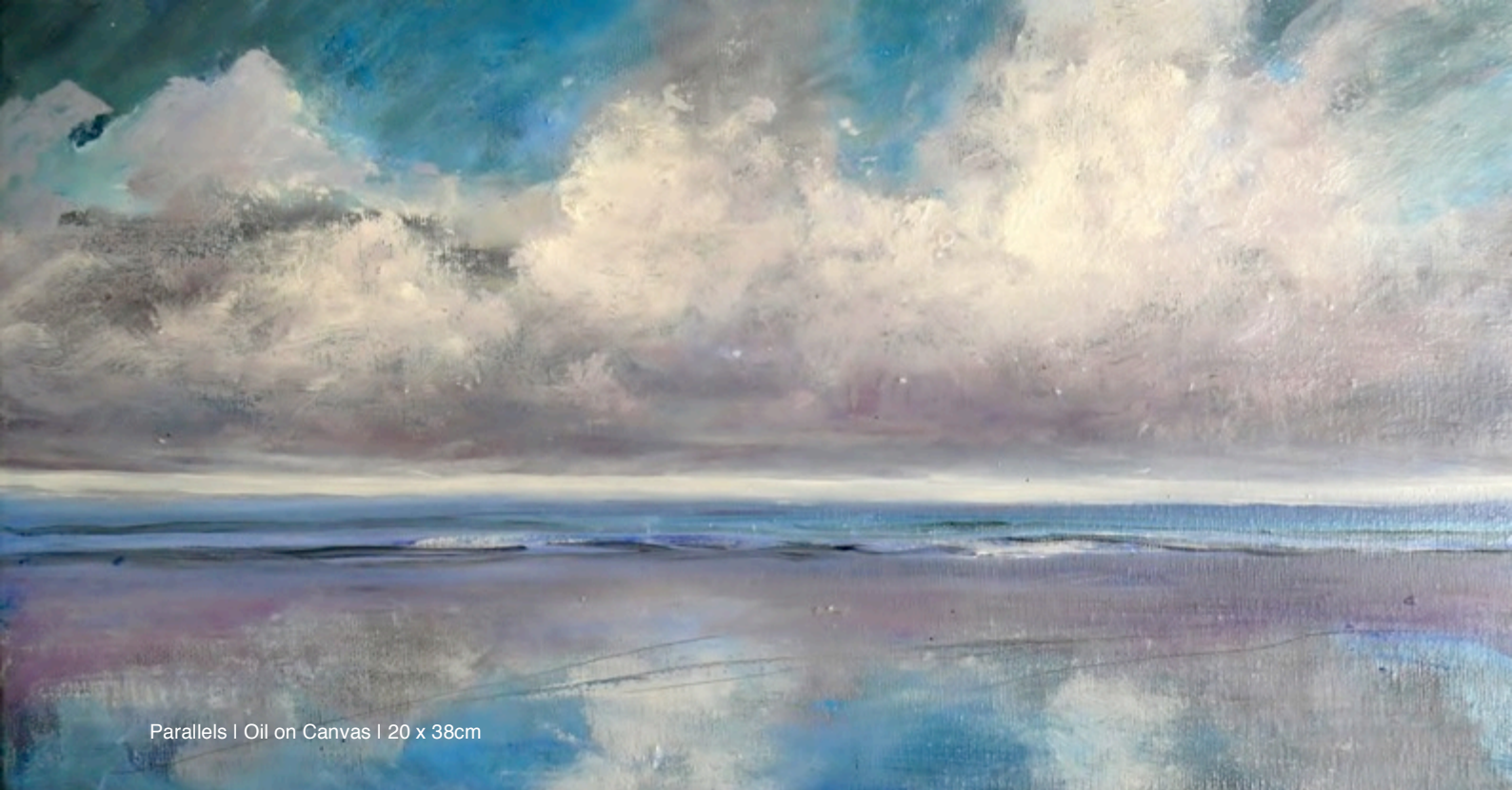
Parallels | Oil on Canvas | 20 x 38cm