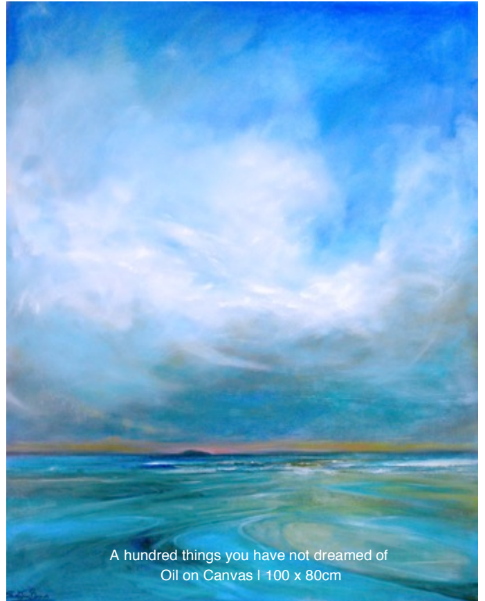
A hundred things you have not dreamed of Oil on Canvas | 100 x 80cm