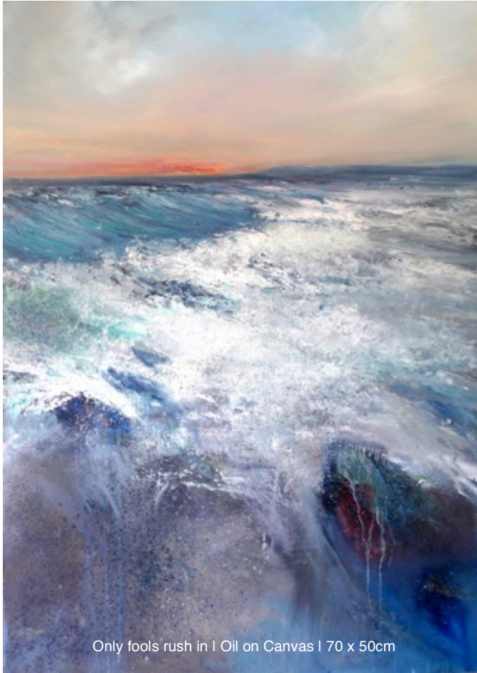
Only fools rush in | Oil on Canvas | 70 x 50cm