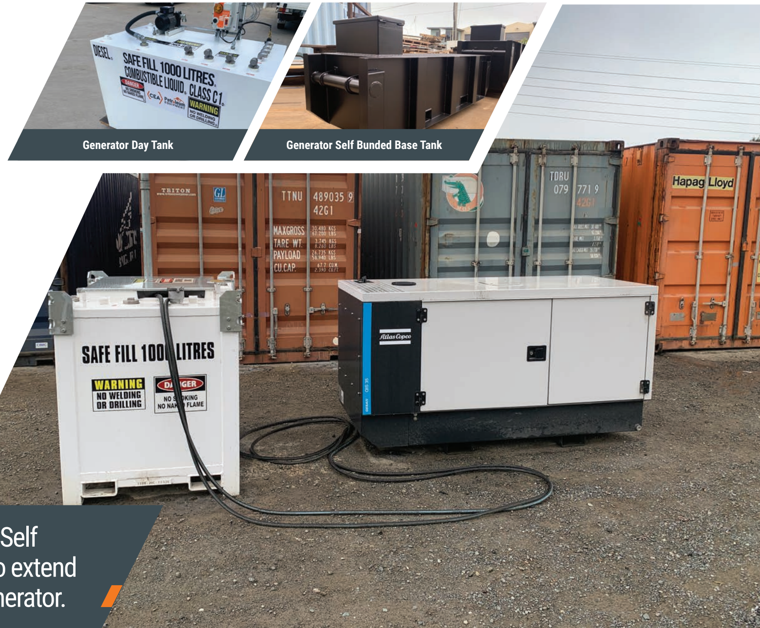
Generator Day Tank

CEA Petroleum Containerised Self Bunded Tanks can be used to provide bulk diesel storage for large generator power station facilities. Our experienced team can provide an engineered bulk fuel facility design for your large power generation project.