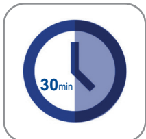
ciclo di lavoro - duty cycle