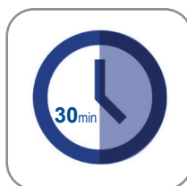
ciclo di lavoro 150L duty cycle 150L