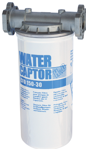
150 L/MIN WATER CAPTOR WITH WATER ABSORPTION