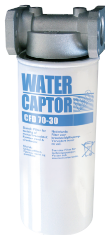
70 L/MIN WATER CAPTOR WITH WATER ABSORPTION