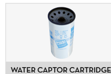
WATER CAPTOR CARTRIDGE