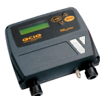
TANK LEVEL INDICATOR