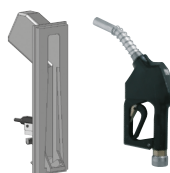
NOZZLE SWITCH WITH A60