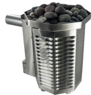
Model 240 40,000 BTU

saunas.com info@saunas.com 1-888-503-8157