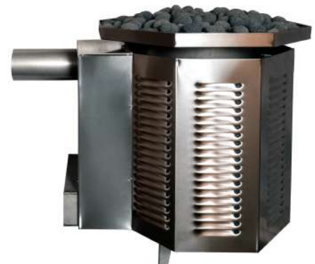
Model 280 80,000 BTU