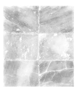
White Salt Panels