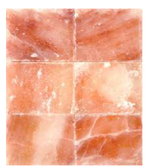
Pink Salt Panels

Create beautiful patterns with our Himalayan Salt Panels and enjoy their 84 naturally occurring minerals