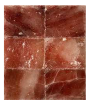
Red Salt Panels