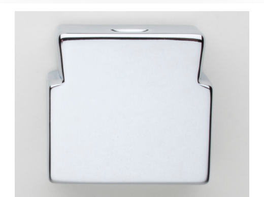
ComfortFlo Steam Head