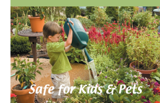
Safe for Kids & Pets