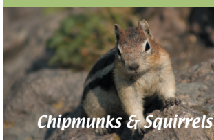
Chipmunks & Squirrels