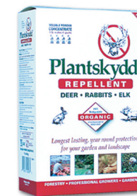
Soluble Powder Concentrates