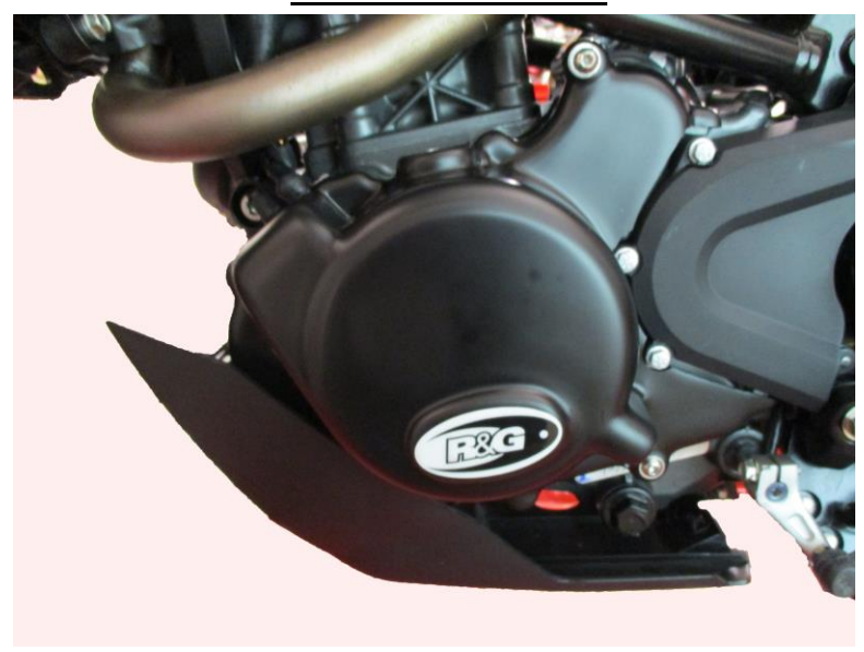
In this kit there should be: 1 x Engine Case Cover (ECC0241). 3 x Spacers (S0820) 3 x M6x40mm long button head bolts. 3 x M6 Washers.