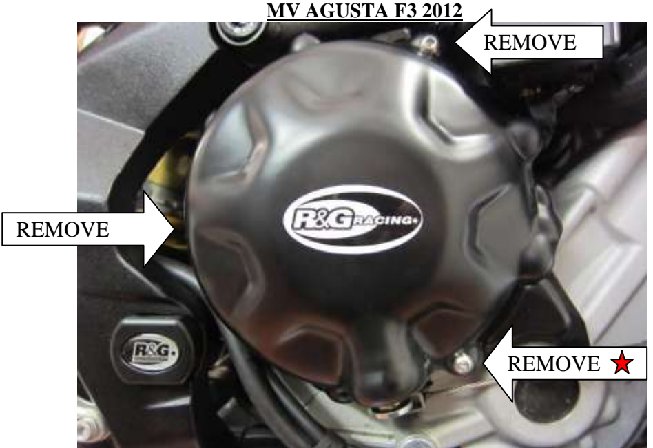
In this kit there should be: 1 x Engine Case Cover (ECC0147) 3 x M6x35mm long button head bolts 1 x M6 Washer

FITTING INSTRUCTIONS FOR ECC0147 RHS CLUTCH CASE COVER