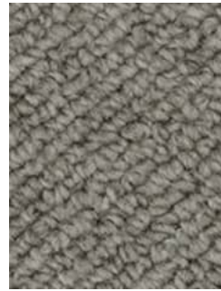
730 Grey Mist