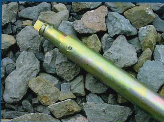
Steel, zinc-plated. Weight 2.5kg