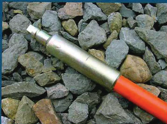
Insulated: fibre glass/steel. Weight 2.5kg

zwicky TRACK TOOLS ...engineered to last