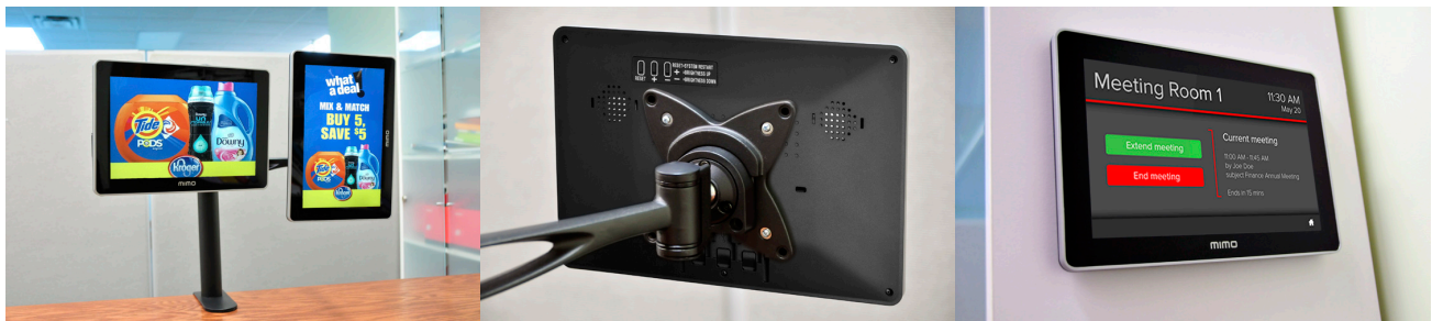
Shown with optional monitor mounts

Mimo Monitors 743 Alexander Rd. Suite 15 Princeton, NJ 08540