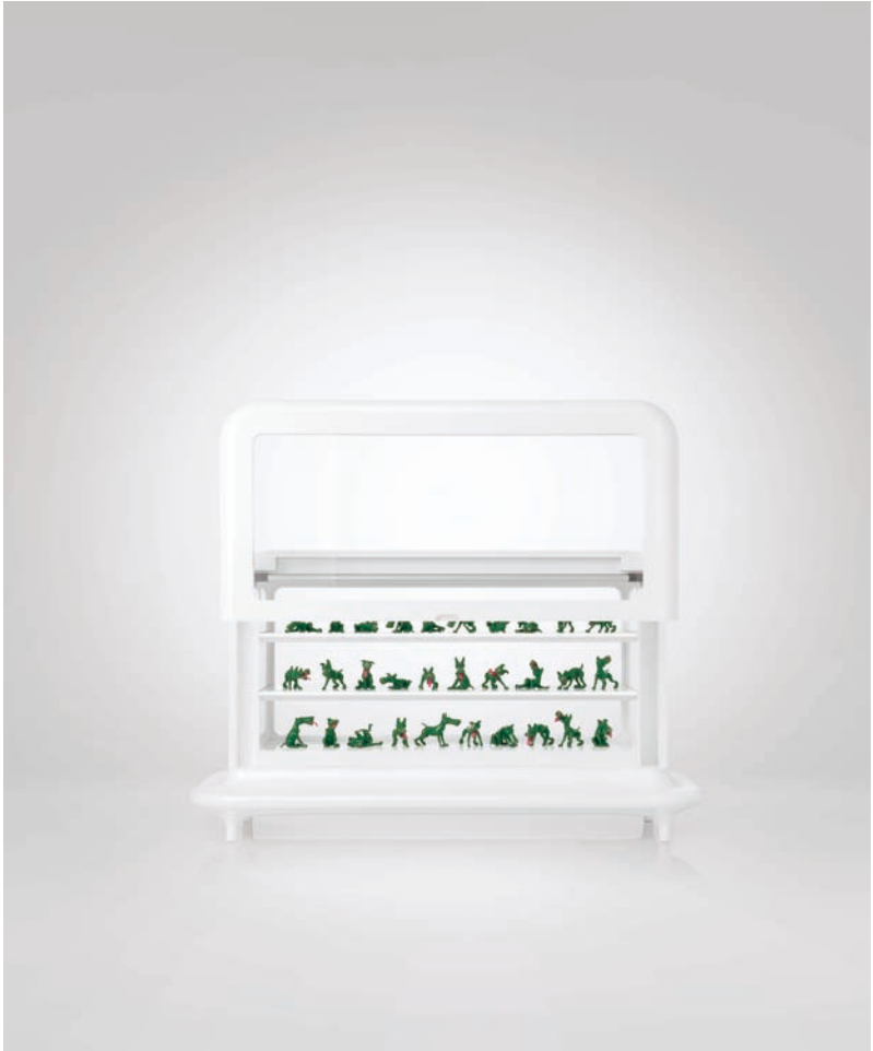
Alternate view of ALIVE