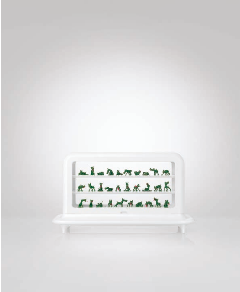
Alternate view of ALIVE