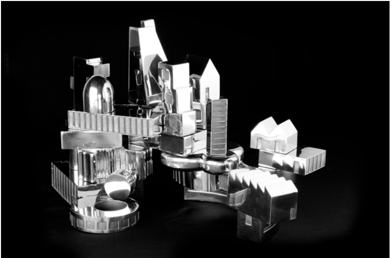
Alternate view of Jia Shan De Wu ( Urban Arcadia )