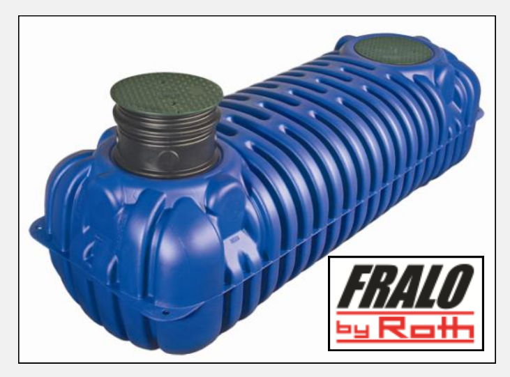
FRALO brand septic tank by ROTH Global Plastics, Inc.