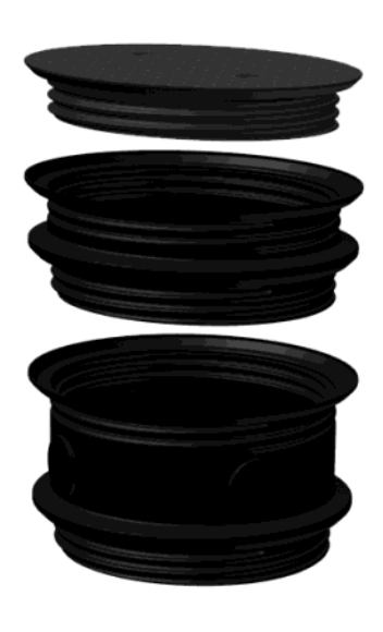
Roth Riser System STAR®