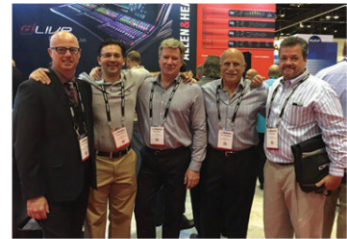
The team at Richard Dean Associates

NEW YORK, NY—PRIMEVIEW USA has added PC VISIONS as manufacturer representative for the states of California, Nevada, Oregon, Washington, Montana, Idaho, and Wyoming.