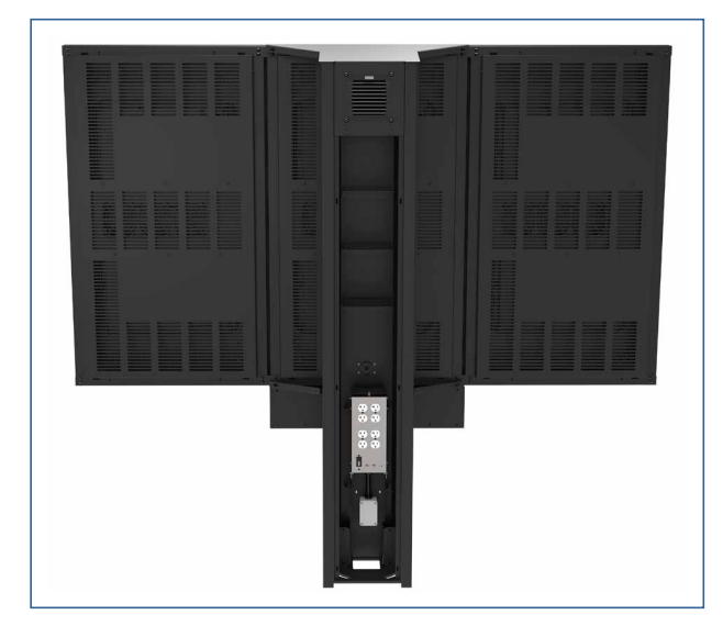
Peerless-AV Outdoor Digital Menu Board (KOF555-3) with KOF-OPT-ELECTRICAL Power Distribution Unit

Please visit peerless-av.com/en-us/patents for patent information.