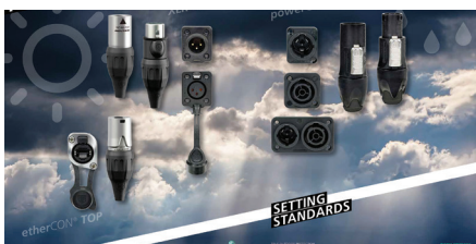
Neutrik's True Outdoor Protection (TOP) series products

The powerCON TRUE1 TOP product line features all-black, high-impact, UV-resistant materials. The etherCON TOP products feature rugged RJ45 cable carriers; CAT 5 chassis connectors for vertical PCB mounting, horizontal PCB mounting, and D-size feedthrough. The XLR TOP product line comprises three- and five-pin male and female XLR cable connectors plus male and female D-size chassis connectors and a UV-resistant chassis connector protection cap.