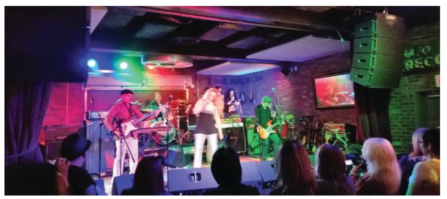
Lucky Strike Live in Los Angeles features a Bose Professional ShowMatch compact line array loudspeaker system.

With these issues in place, Northern Quest Resort & Casino decided to seek