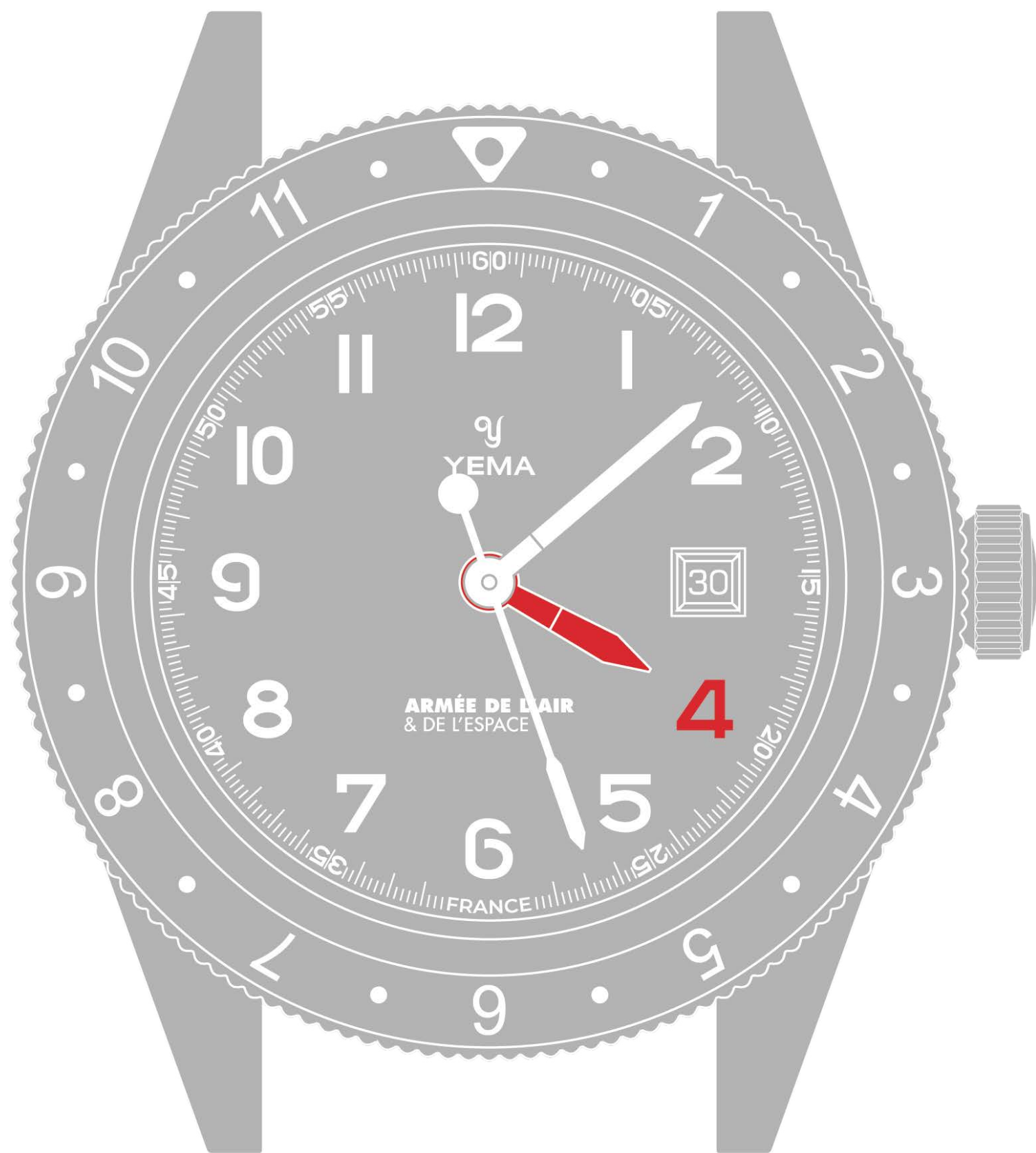
LOCAL TIME MORTEAU, FRANCE 04:10