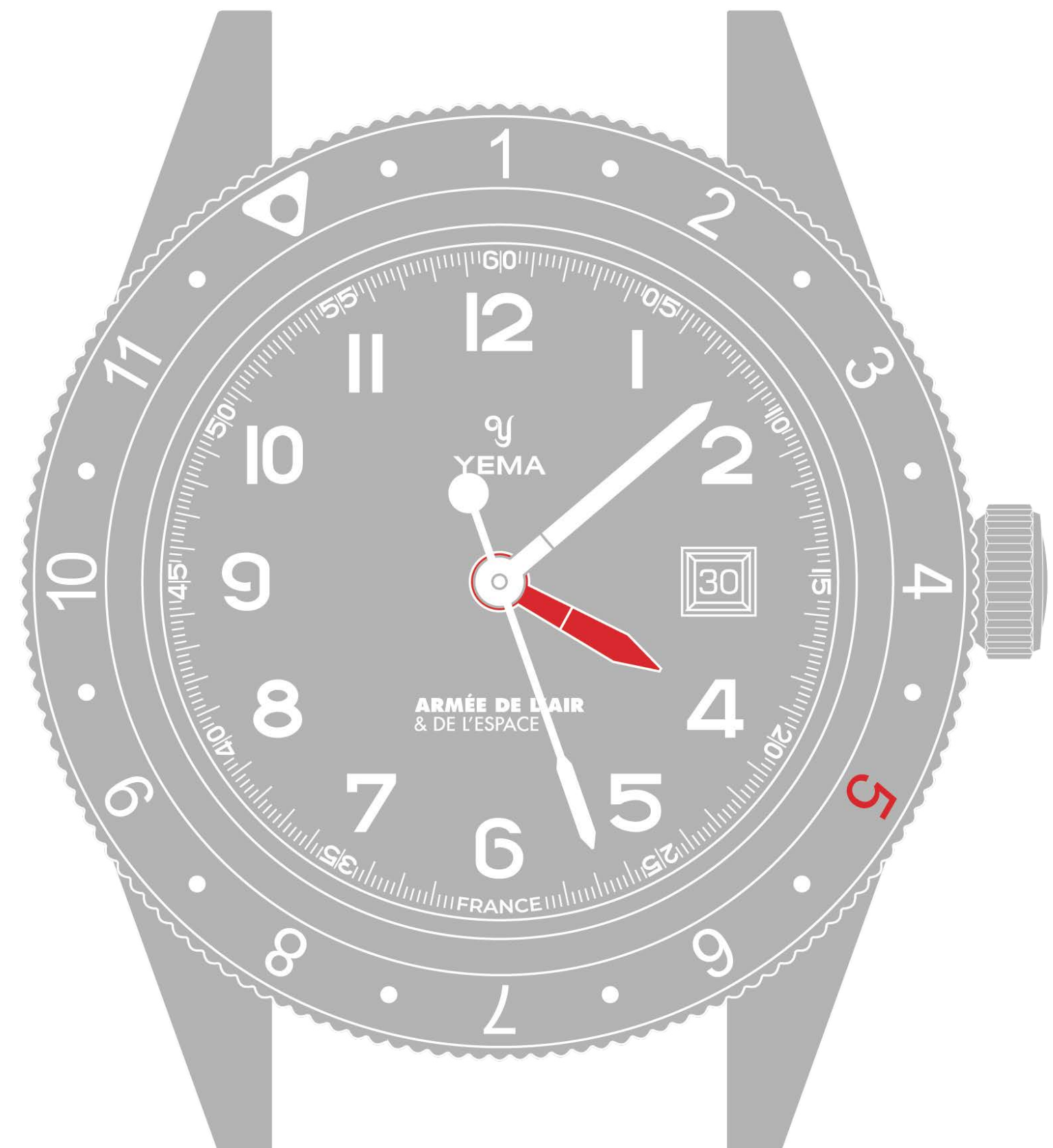
DEPARTURE TIME ATHENS, GREECE 05:10