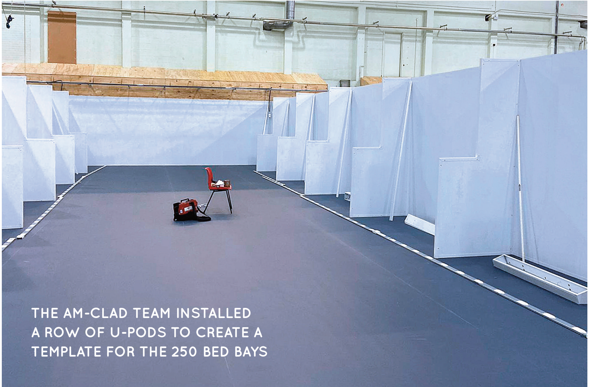
THE AM-CLAD TEAM INSTALLED A ROW OF U-PODS TO CREATE A TEMPLATE FOR THE 250 BED BAYS