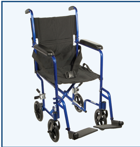
REF. ATC-BL Shown

It is important for the attendant to be familiar with proper assisting procedures in any situation that requires the use of the Transport Chair. Safety is the Key consideration. Consult your physician, nurse or physical therapist to determine methods most suitable for your individual needs and abilities.