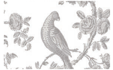
Bird, looking right

For each unique sheet in the design, the creature on that sheet will either appear towards the top or the bottom of the sheet. This allows us to distinguish and number each individual sheet as follows: