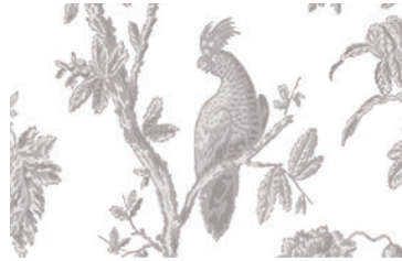
Bird, looking left