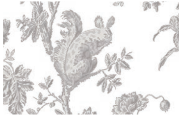
Squirrel, tail up

Firstly, notice that there are four distinct creatures in this design, which we have named as follows: