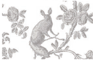
Squirrel, tail down