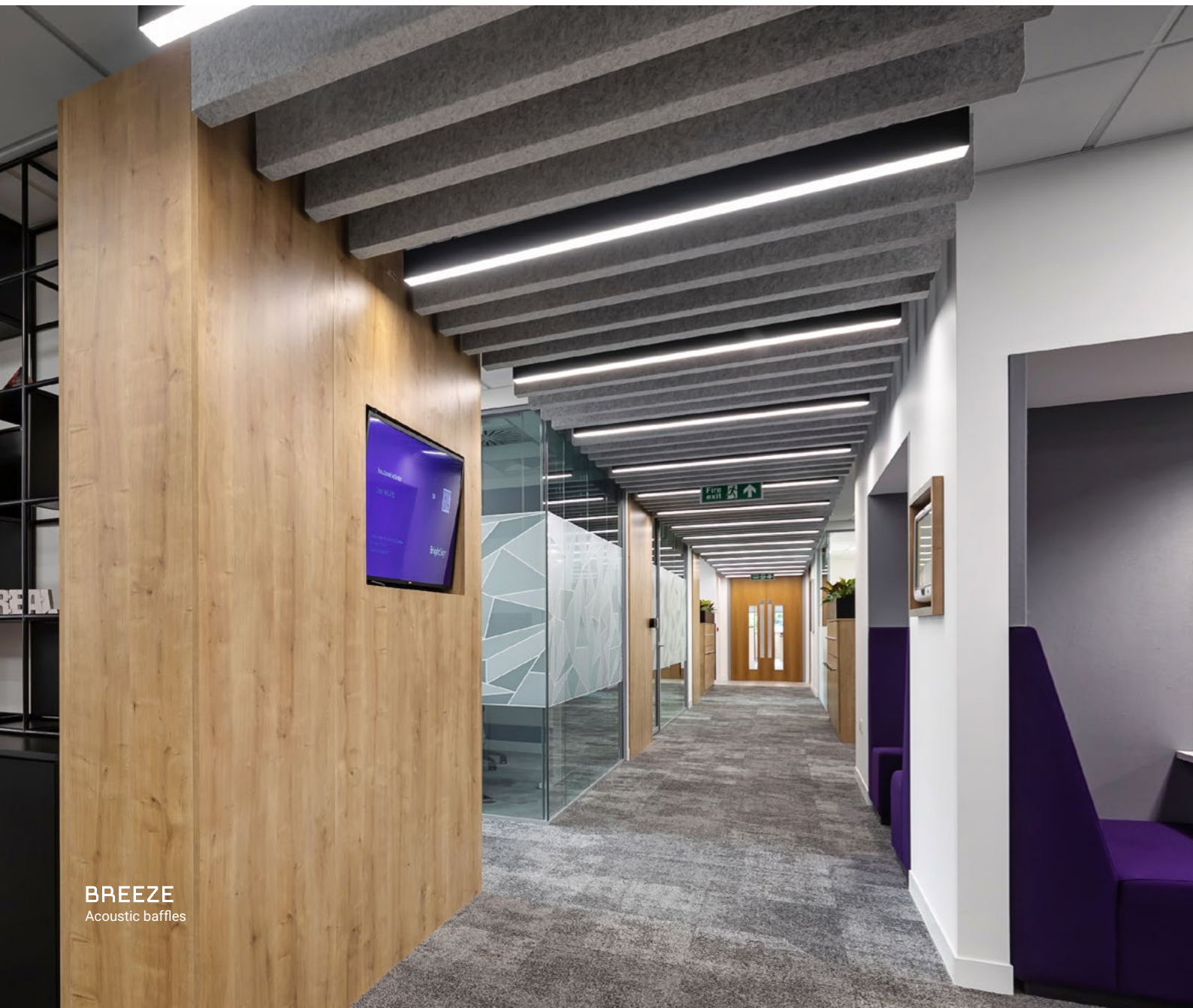
BREEZE Acoustic baffles