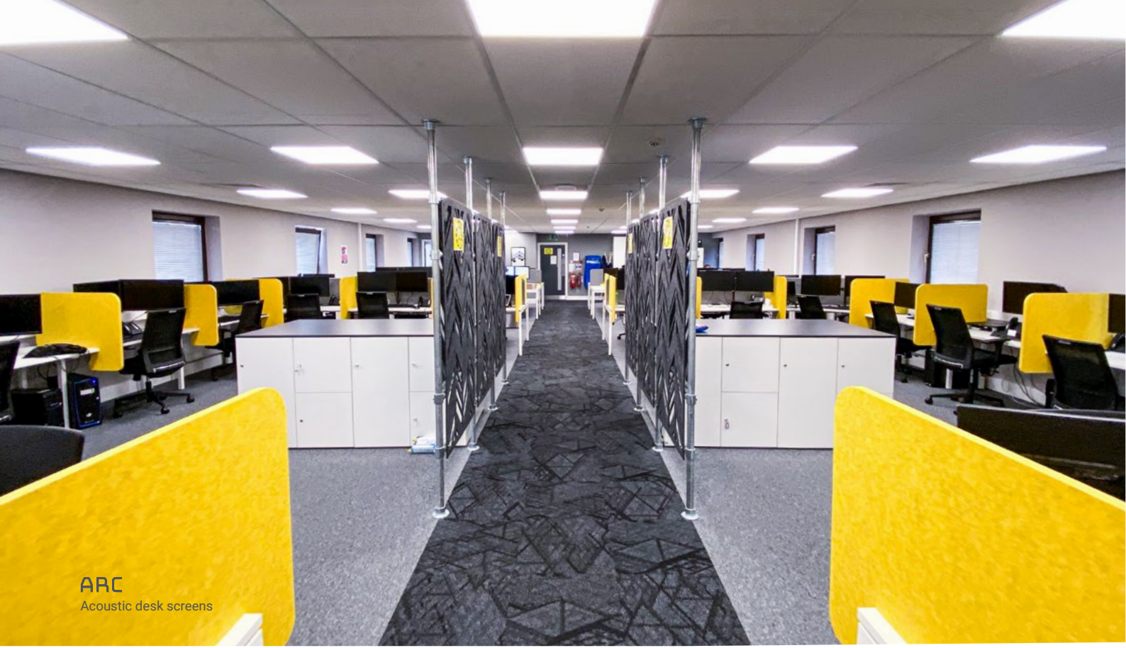
ARC Acoustic desk screens