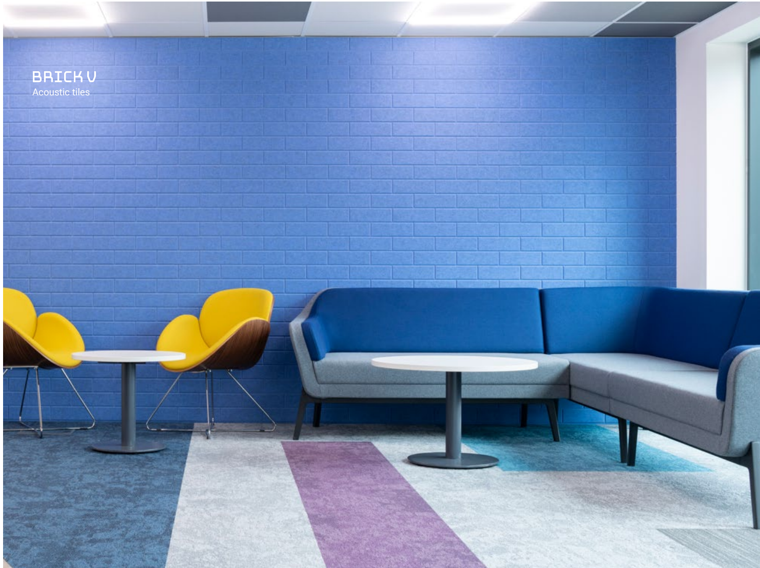
BRICKU Acoustic tiles