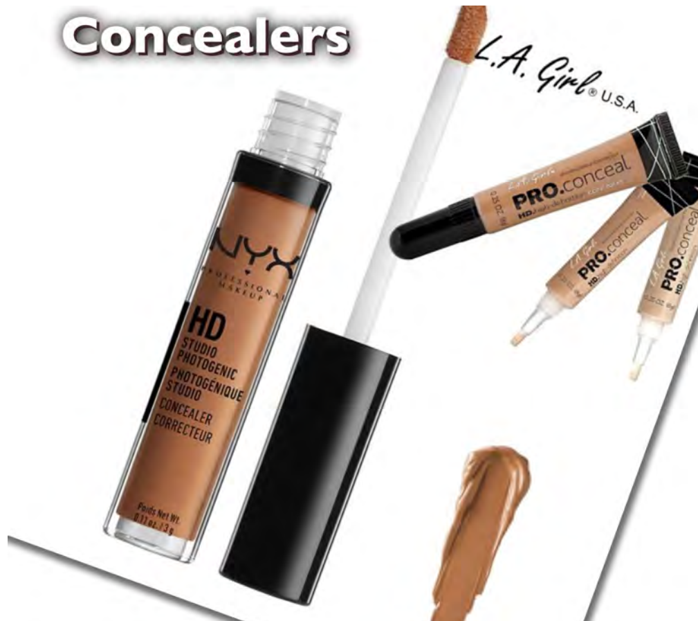
CONCEALER SUGGESTIONS... THESE CAN BE FOUND AT YOUR LOCAL BEAUTY SUPPLY AND CVS