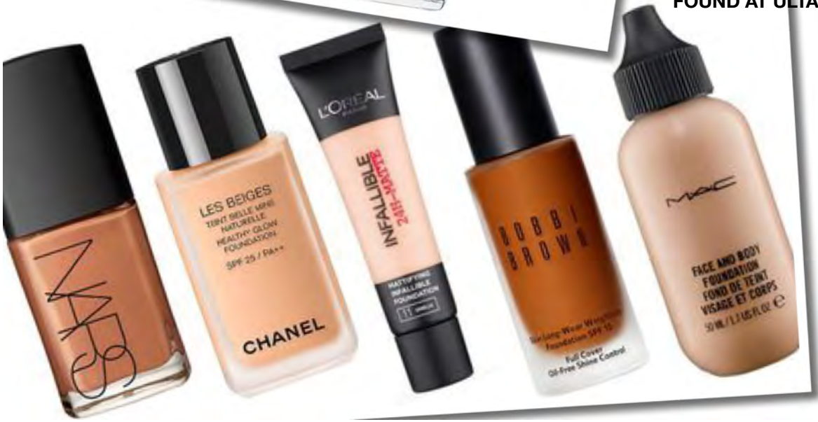
FOUNDATION SUGGESTIONS & BEAUTY BLENDERS ( SPONGE)

MAKEUP BRUSHES AND SPONGES CAN BE FOUND AT ULTA BEAUTY , WALMART , TARGET