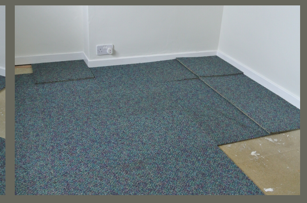
FILL IN THE GAPS Lay the carpet tiles tight to each other and fill in the rest of the cross.