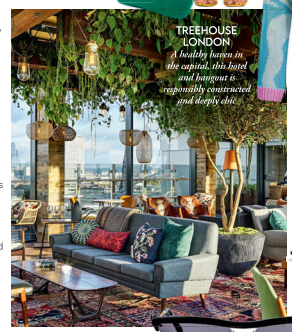
TREEHOUSE LONDON A healthy haven in the capital, this hotel and lounge is responsibly constructed and deeply chic.

Sustainability is fashion's current buzzword. As more and more luxury houses take an eco-conscious stand, guilt-free glamour need no longer be a contradiction in terms. In Britain, many brands are adopting a no-waste approach, while also nurturing the skills of homegrown artisans, to cater for fashion-conscious people with a conscience. Irish-born, London-based designer Richard Malone has been redefining luxury since 2015, creating sculptural masterpieces from ethically sourced materials. Meanwhile, House of Sunny, adored by cool girls in the capital, battles wasteful fast fashion with fun and flirty 1990s-inspired pieces in small runs using ethical fabrics. In 2021, it really is easy being green.