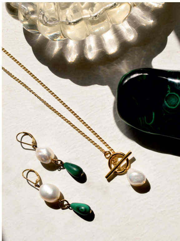
SALOME Penelope collection featured in TATLER Best of British sustainable brands