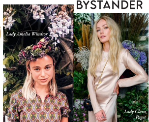
Lady Amelia Windsor