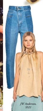
JW Anderson, $321