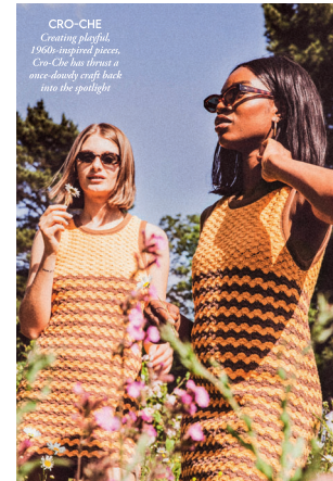
CRO-CHE Creating playful, 1960s-inspired pieces, Cro-Che has taken a once-dandy craft back into the spotlight