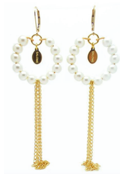
Tribal Pearl Fringe Earrings