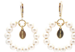
Tribal Pearl Earrings