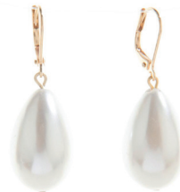
Girl With A Pearl