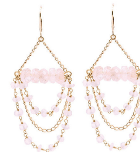
Tilly Rose Quartz Earring