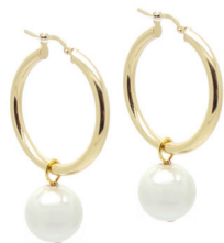
Daphne Pearl Hoop Earrings (also available in silver)