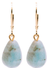
Girl With An Aquamarine