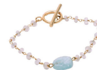
Aquamarine & Moonstone Bracelet