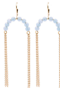
Nola Aquamarine Earrings