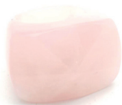
Rose Quartz Ring