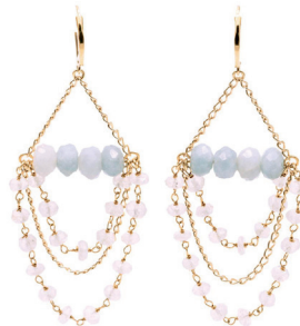
Tilly Aquamarine Earrings