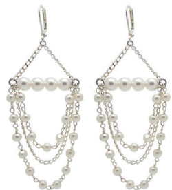
Tilly Pearl Earring