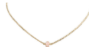
Rose Quartz Necklace