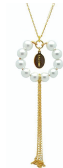
Tribal Pearl Necklace