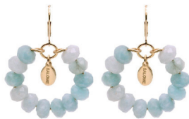
Tribal Aquamarine Earrings