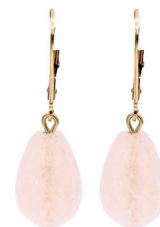
Girl With A Rose Quartz Earrings