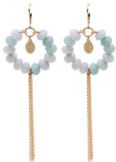
Tribal Aquamarine Fringe Earrings