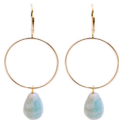
Signature Aquamarine Earrings