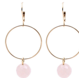
Lorna Rose Quartz Earrings (also available in aquamarine)