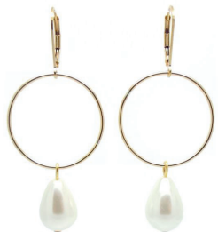
Signature Pearl Earrings