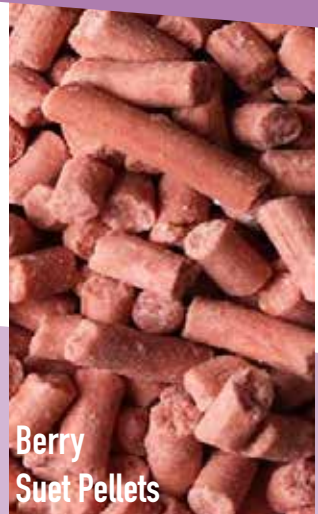
Berry Suet Pellets

They are suitable for all wild birds including young and adult birds, and as suet pellets do not have the same choking hazard as peanuts.