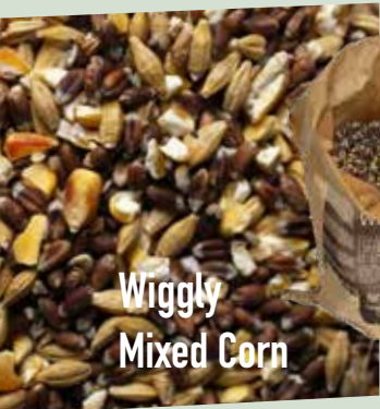
Wiggly Mixed Corn