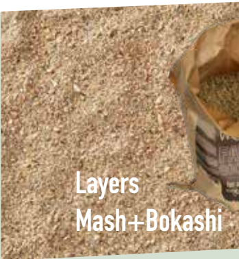
Layers Mash + Bokashi

Here are some our favourite foods for your hens: