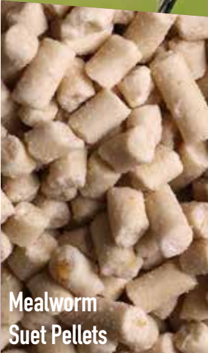
Mealworm Suet Pellets

Mealworm Suet Pellets are delicious, easy to digest and jam-packed with energy.