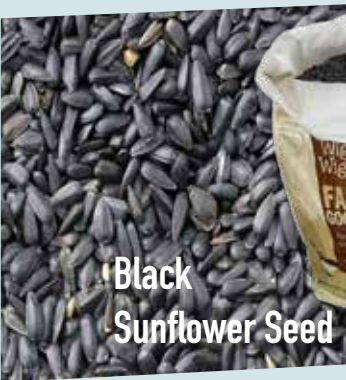
Black Sunflower Seed

Our black sunflower seeds are packed with oils and protein making them a year round alternative to peanuts, but at a significantly lower cost as they don't need to be shipped from Africa.