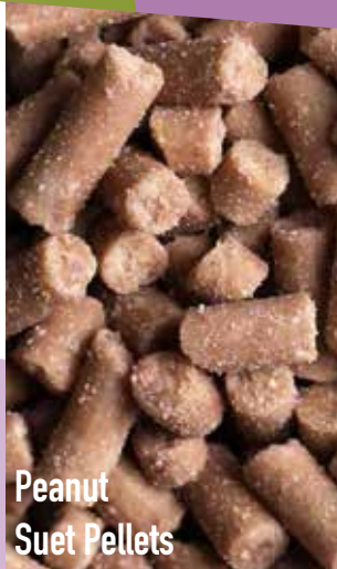
Peanut Suet Pellets

These Suet Pellets contain peanuts. They are perfect for your bird table and softbill birds (such as blackbirds) love them scattered on the ground.