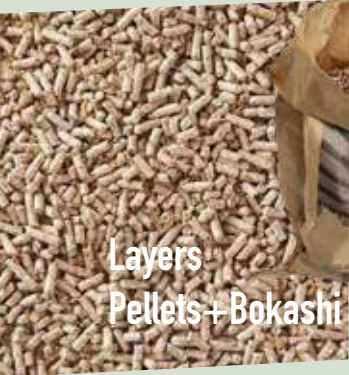
Layers Pellets + Bokashi