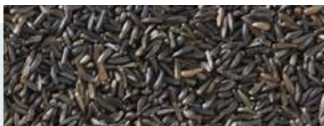
NIGER SEED F0142