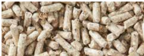
LAYERS PELLETS + BOKASHI P0132