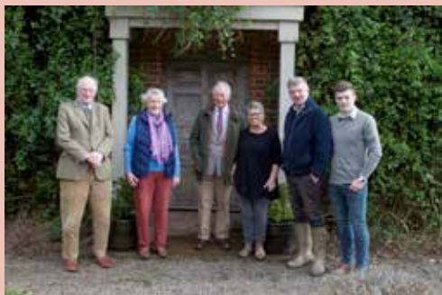
3 GENERATIONS OF THE FARM