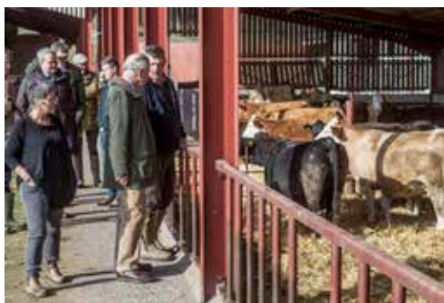
MEETING OUR COWS