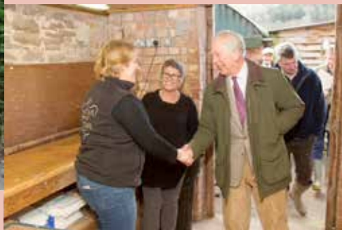
RACH EXPLAINING MEALWORMS