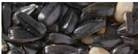
BLACK SUNFLOWER SEED F0145