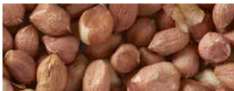
PREMIUM PEANUTS F0139