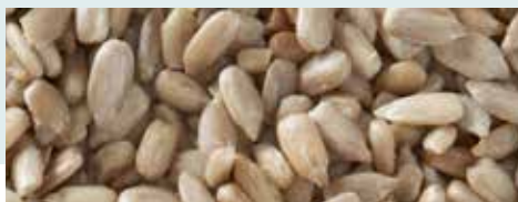
SUNFLOWER HEARTS F0136