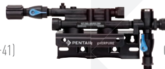
QC7I TWIN HEAD (EV9272-22)