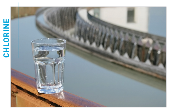
Chlorine is used by municipalities to kill bacteria and viruses that cause illness. It can be removed with filters that have carbon. Chlorine has two disadvantages: it's a gas that can dissipate before it reaches consumers, and it easily bonds with organics to create undesirable byproducts such as THMs.

Chloramine is chlorine bonded with ammonia. This provides more stability for better disinfection over long distances in pipe lines. It lasts two or three days instead of just a few hours for free chlorine. Also, because it's less likely to create byproducts such as THMs, it helps municipalities meet new EPA guidelines for drinking water.