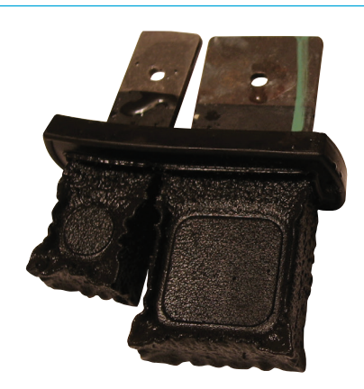
Chloramine damage on a valve disc used in a water treatment product.

Chloramine also can damage rubber and many synthetic gaskets and o-rings, causing them to become brittle or shrink, resulting in leaks of fluids and loss of pressure. In addition, chloramine, like chlorine, is corrosive to metals, especially copper. It can cause pitting and cracking even on stainless steel. These can result in equipment downtime, higher service costs and reduced equipment life, all costing you money.