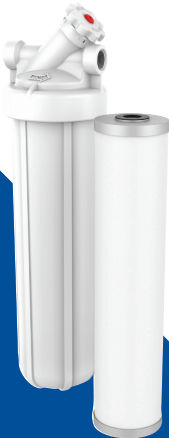
Pentair LR-BB50 Heavy Duty Lead Filtration System (Cartridge Included)

Undesirable contaminants such as lead and cysts can exist in original water sources or pipes outside your home and can cause a variety of health issues. The Pentair® Heavy Duty Lead Filtration System can reduce these contaminants before they enter your home.