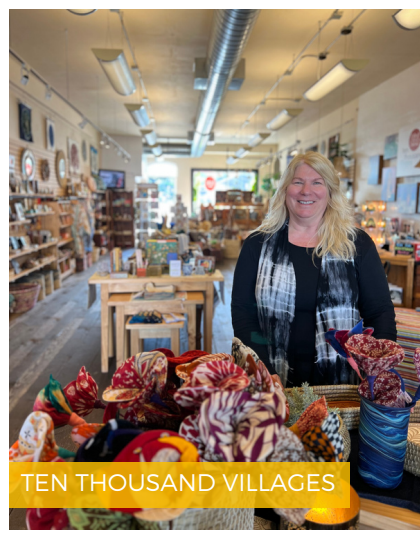
TEN THOUSAND VILLAGES