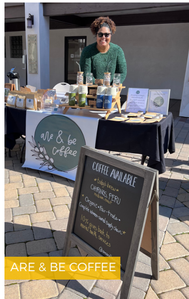
ARE & BE COFFEE