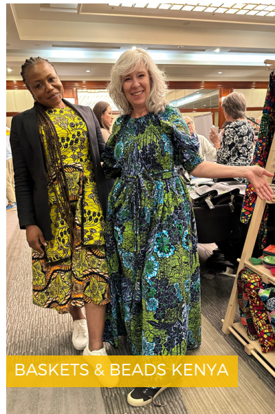
BASKETS & BEADS KENYA