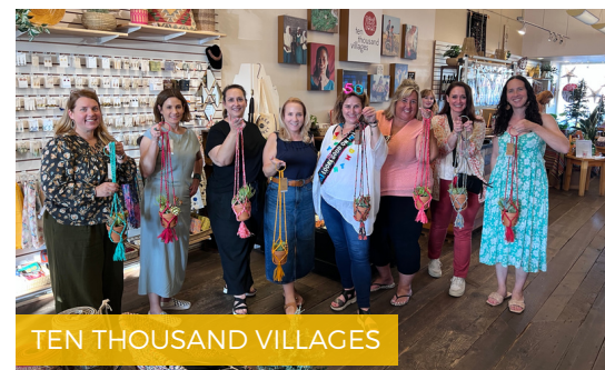
TEN THOUSAND VILLAGES