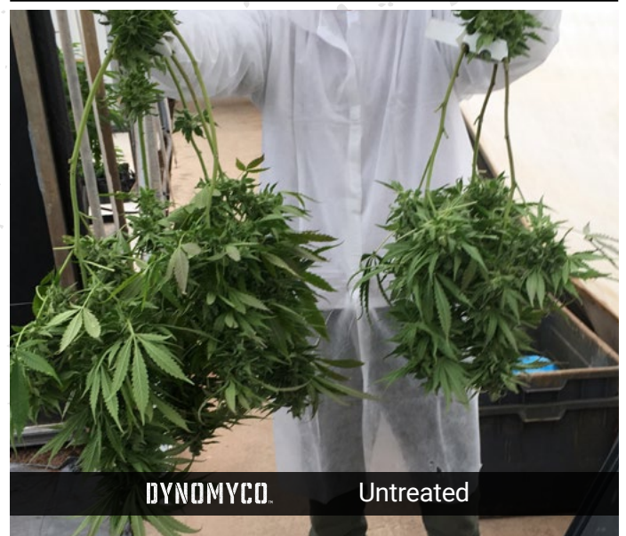
Pharmacann LTD, Israel, 2018 - Cannabis plants treated with DYNOMYCO™ showed a 19% increase in flower yield and a 5% increase in stem width (Ella cultivar).