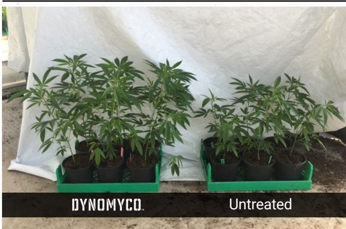
Seàch Farm, Israel, 2018 - In an ongoing cannabis trial (Black Label cultivar), DYNOMYCO™-treated plants showed a 15% higher growth rate (height and stem), 30 days after treatment.