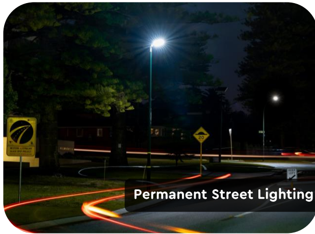
Permanent Street Lighting