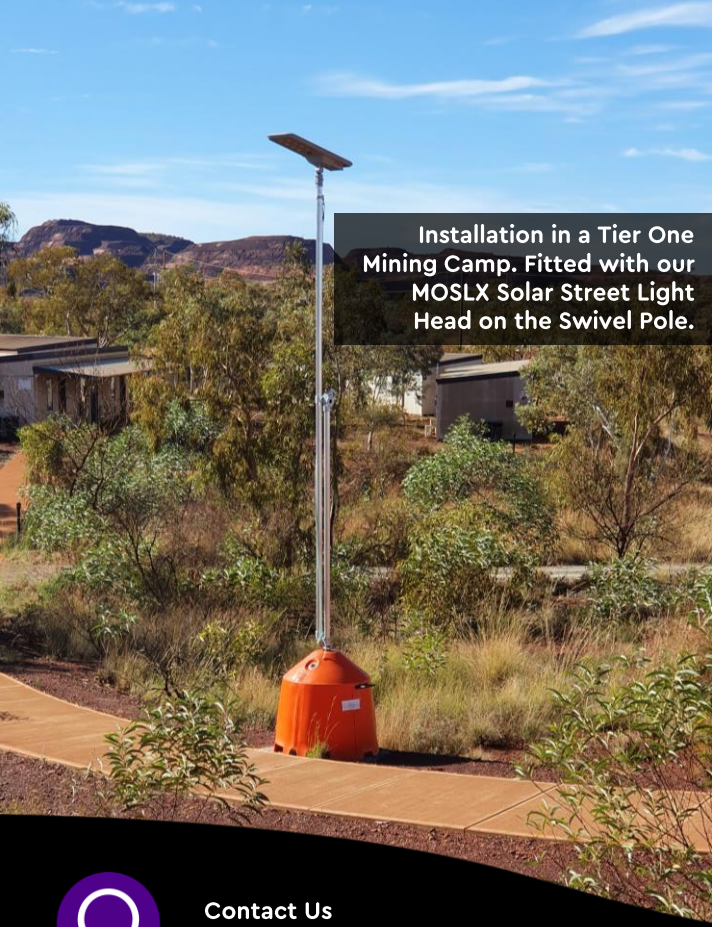
Installation in a Tier One Mining Camp. Fitted with our MOSLX Solar Street Light Head on the Swivel Pole.