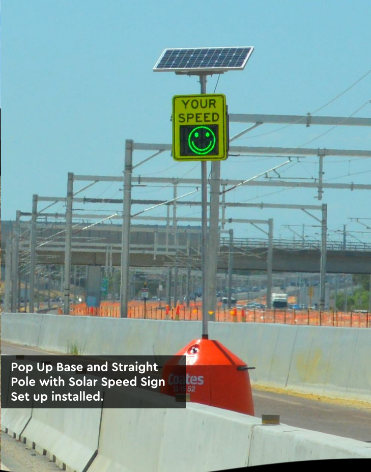
Pop Up Base and Straight Pole with Solar Speed Sign Set up installed.