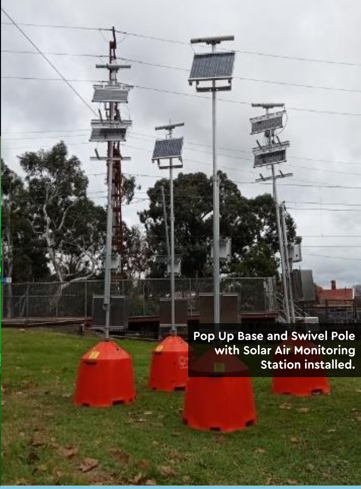
Pop Up Base and Swivel Pole with Solar Air Monitoring Station installed.