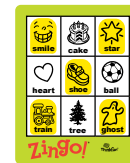
"X Marks the Spot"