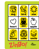
"Z is for ZINGO!"