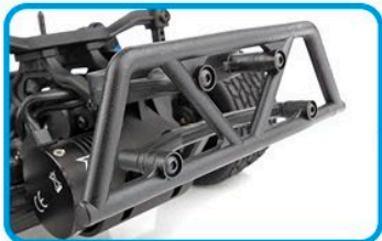
Impact-absorbing front and rear bumpers