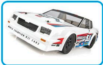
Factory-finished Street Stock body with integrated rear spoiler