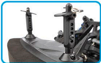
Adjustable body mounts