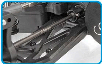
Rear CVA driveshafts for more reliability