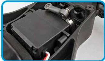
High-torque, metal-gear Reedy servo with spring-style servo saver