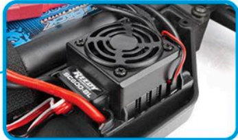
Water-resistant high-power Reedy brushless speed control with T-plug connector and LiPo low voltage cutoff