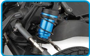
Aluminum 12mm big bore coil-over shock absorbers