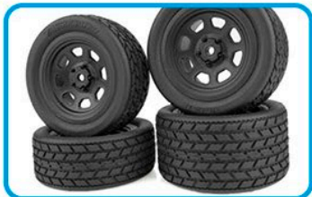
High-grip tires with street stock-inspired tread pattern