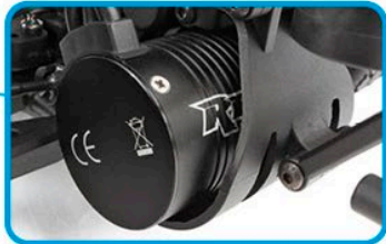
Powerful Reedy 3300kV brushless motor