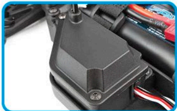
Water-resistant enclosed receiver box