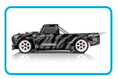
Licensed Hoonitruck body