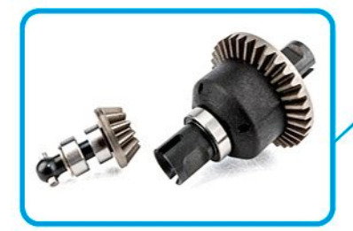
The Apex2 chassis is equipped with metal ring and pinion gears for long-lasting durability that can handle tire-slaying burn-outs