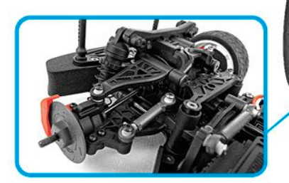
For better handling, A-arm front and rear independent suspension keeps the Hoonitruck under control during the wildest of driving conditions