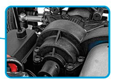
A sealed center driveline keeps dirt and debris out--along with bits of tire rubber--for smooth and reliable power delivery