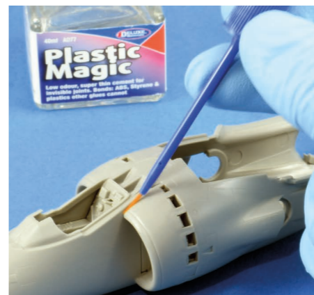
Plastic Magic AD77 will also give an instant, invisible bond to any joint.....