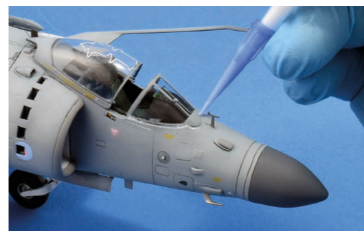
Canopies are tricky, so Glue 'n' Glaze is perfect for this. This product dries crystal clear and remains flexible. Apply to the parts to be bonded and hold in place for around 15 mins until dry. The clean up any excess with some water