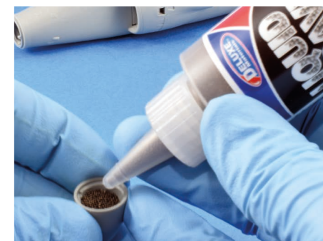
Liquid Gravity BD38 acts as a free owing weighting system and is non-toxic. Pour to the desired weight....