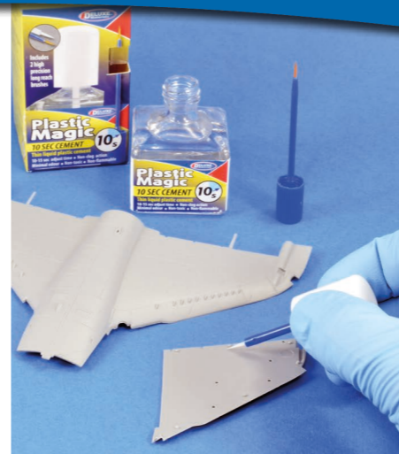
Plastic Magic AD83 once again is the ideal product for joints that need time. Spread around the wing.....