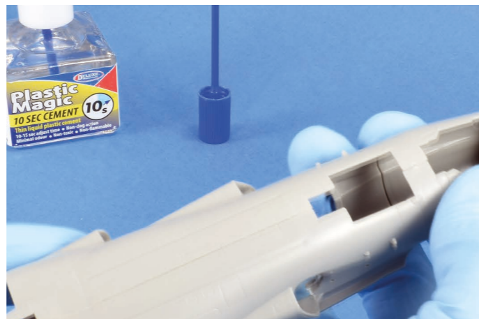
Plastic Magic AD83 allows an adjustment time before bringing parts together, leaves no residue, and gives a neat and invisible joint