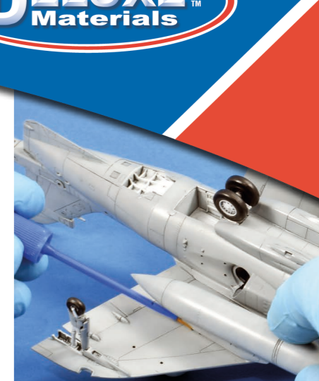
For parts that need instant bonding use Plastic Magic AD77. The high precision brush gives a clean, neat invisible joint