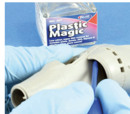
...and the high precision long reach brush enables perfect gluing in exposed outside parts or difficult places