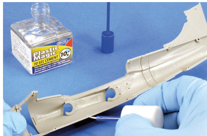
Use Plastic Magic AD83 where a longer working time is required. This is ideal for gluing the fuselage. This product has a 10-15 adjustment time

Building the Kinetic Sea Harrier F/A-2 with Deluxe Materials Products