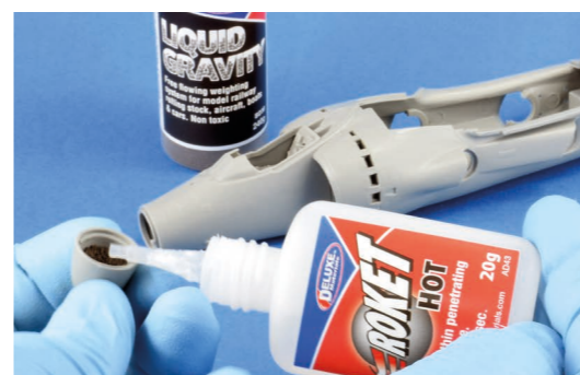
...and apply a drop of ROKET Hot AD43 cyano to set it