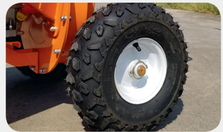
ATV Tires-locking - Off Road only