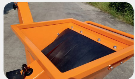
Large Feed Chute