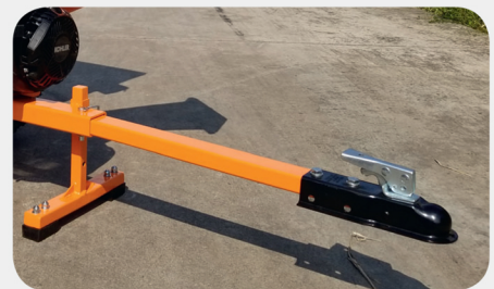
1 7/8" Removable Tow Bar