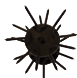
Tines, Finger PN: 130750