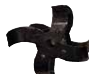
Tines, Slasher PN: 130718