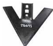
Sweep, 12"/18" PN: 336693/336694