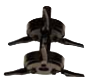
Rotors, Aerator PN: 130775