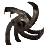
Tines, Bolo PN: 130744