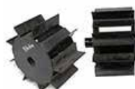
Till Hoe PN: 336801