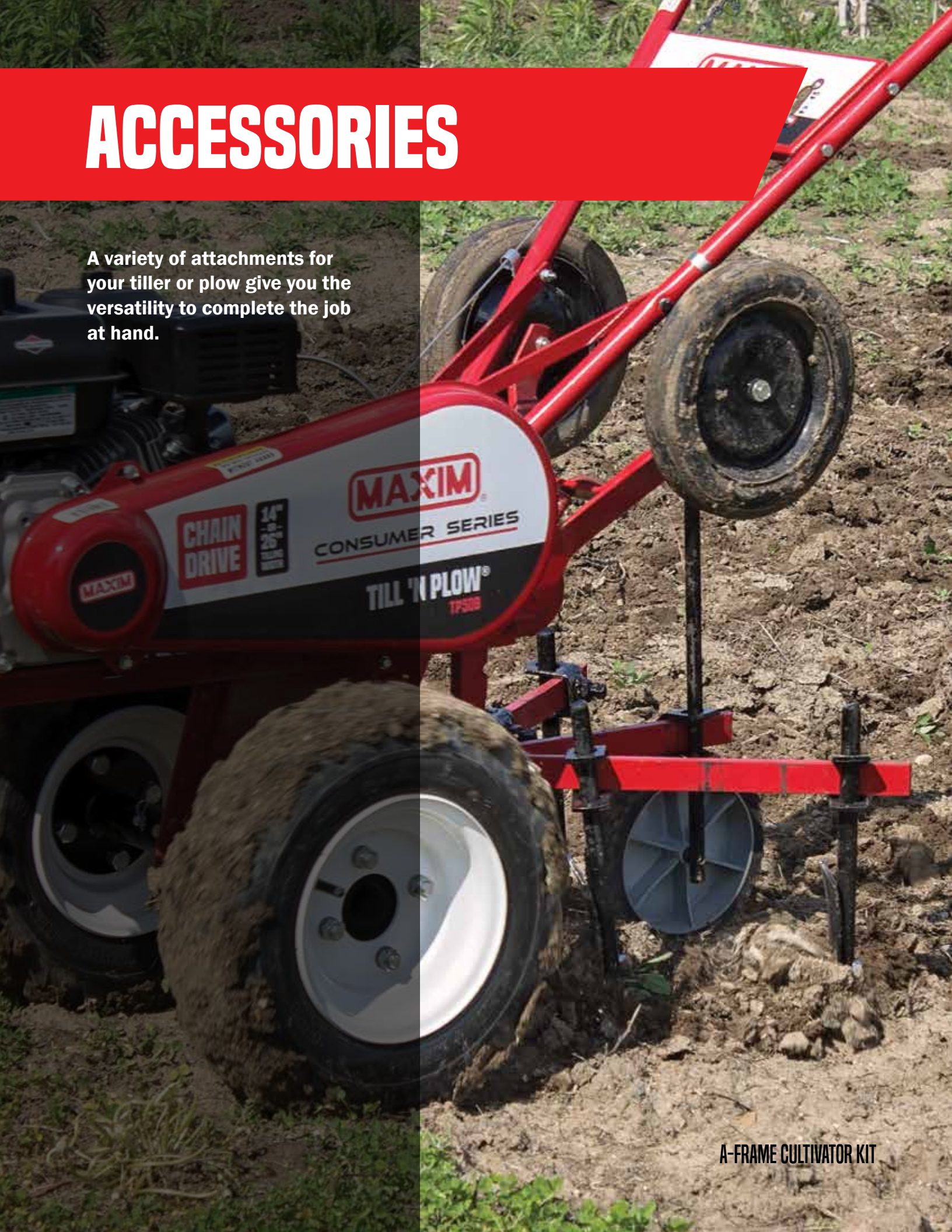
A-FRAME CULTIVATOR KIT

A variety of attachments for your tiller or plow give you the versatility to complete the job at hand.