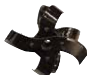
Tines, Slasher PN: 130761