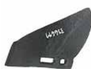
Shovel, Turn (RH) PN: 336697