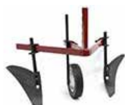
A-Frame Turn Shovel Kit PN: KT1933