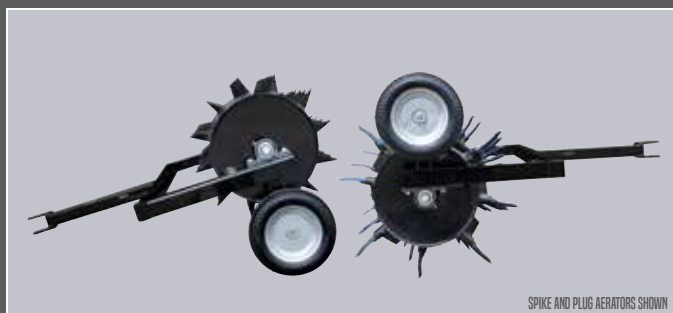
SPIKE AND PLUG AERATORS SHOWN