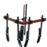
A-Frame Cultivator Kit PN: KT1932-B