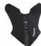
Furrower, 8"/10" PN: 336695/336696