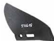
Shovel, Turn (LH) PN: 336698