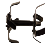
Tines, Mini Bolo PN: 130832