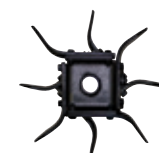
Tines, Pick PN: 130774