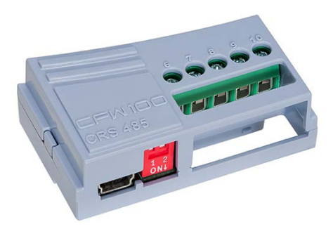
Figure 2.1: Module with RS485 interface

This plug-in module for the CFW100 frequency inverter has one RS485 interface. This standard RS485 interface has two functions: