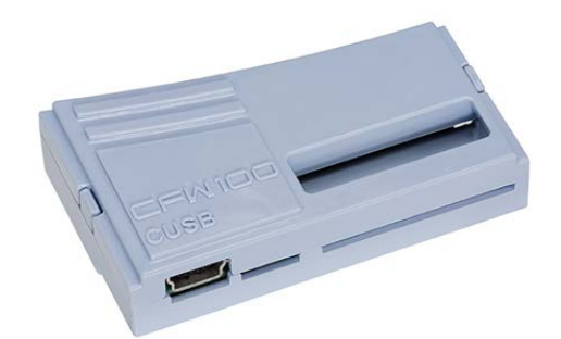
Figure 2.2: Module with USB connection

For this module, a USB interface with mini-USB conector is available. When connecting the USB interface, it will be recognized as a USB to serial converter, and a virtual COM port will be created<sup>3</sup>. Thus communication is made with the drive via this COM port.