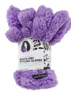
Quick Dry Styling Gloves Dry Hair 20x Faster Than Towels