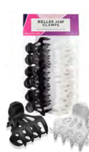
Roller Jaw Clamps Secures Curls While Providing Lift at the Root