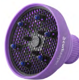
Pop Up Diffuser Perfect for Diffusing Curly Hair