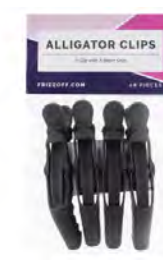
Alligator Clips The Clip with Better Grip