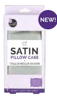
Satin Pillow Case Beauty Sleep For Curls & Skin