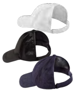
Badazz Backless Caps A Cap Designed For Curls

Whether it's for detangling, styling, or looking great with your best curls, we have the perfect accessories for every curl type!