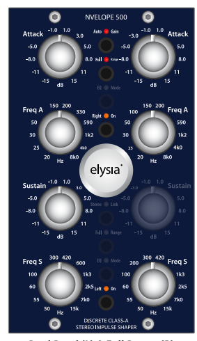
Dual Band (L) & Full Range (R)