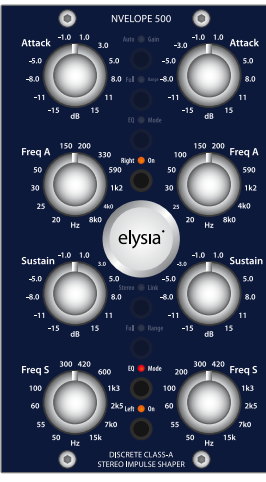
EQ (L) & Dual Band (R)