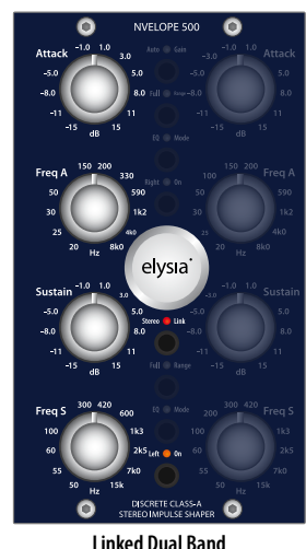
Linked Duai Band