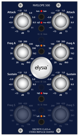
Unlinked Full Range