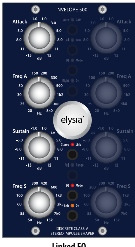
NVELOPE 500 elysia<sup>*</sup>