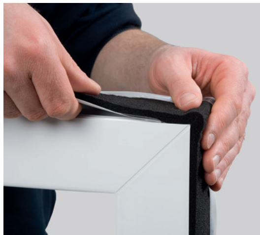
Installation example: ISO-BLOCO ONE

*** Movement in structural elements and temporary longitude changes are to be taken into account by the max. joint width.