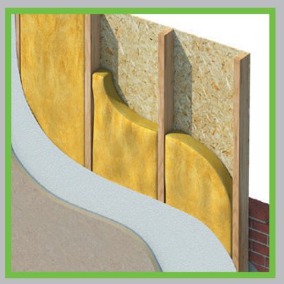
External Walls - Insulating between the timber studs

Timber & Rafter Roll 40 has a fire classification of A1 non-combustible. The highest possible rating.